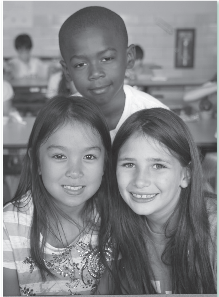
The new Dignity for All Students Act is intended to foster safe and supportive school climates.

We are training select staff members to become Dignity Act Coordinators throughout the district and taking appropriate steps to further enhance our school climate.